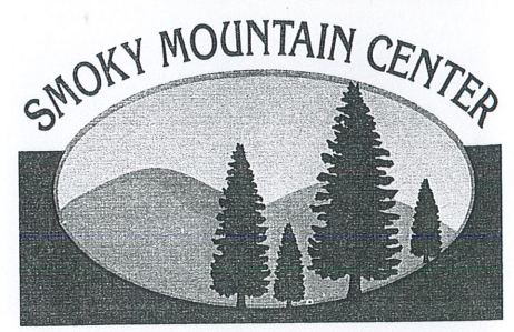
"Meeting community needs... one person at a time."

Smoky Mountain Center 44 Bonnie Lane Sylva, NC 28779