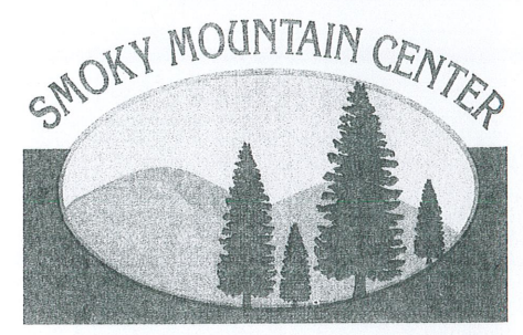
"Meeting community needs... one person at a time."

Smoky Mountain Center 44 Bonnie Lane Sylva, NC 28779